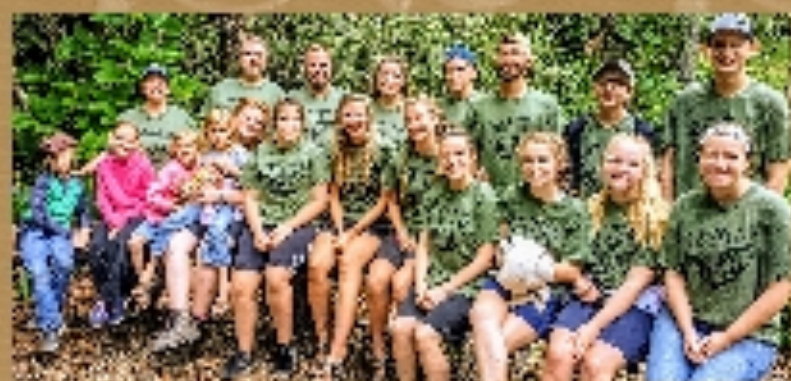
GRACE BAPTIST CHURCH W Columbia, S. C.