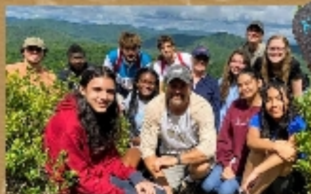
FAITH EXTREME MINISTRIES Winter Haven, Florida