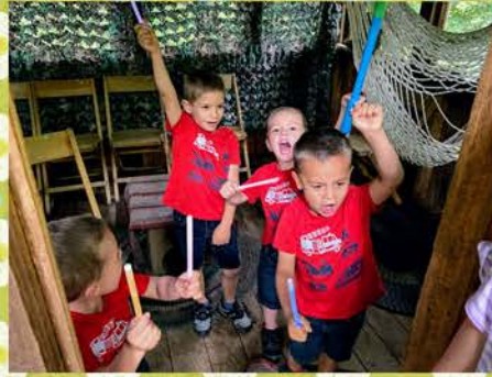
The tree house is behind Antioch but available for all kids.