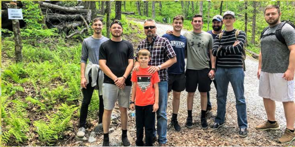
HIKING is very popular. Take a hiking map with you and your cell phone.