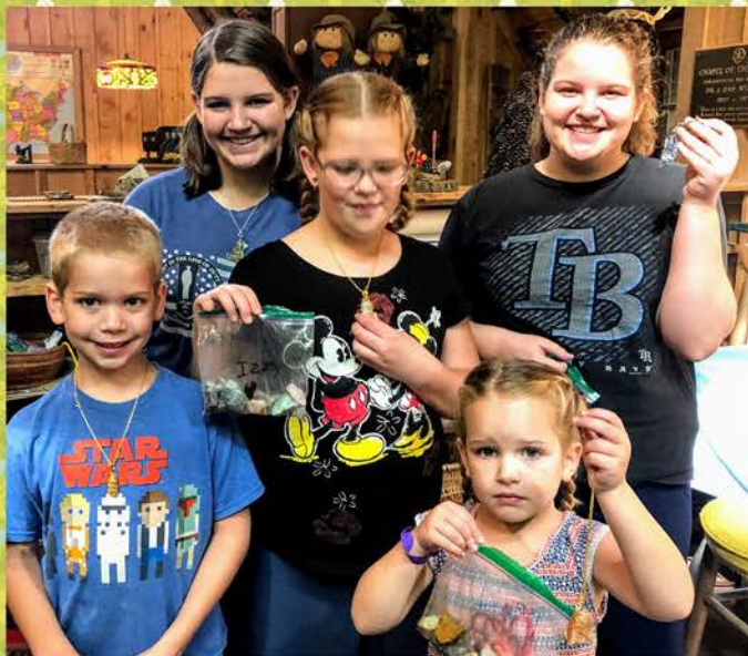
The Craft Shop is a popular place for fun. Check Activities Board for days and time when the Craft Shop will be open. Bring a favorite gem stone from mining and make a necklace.