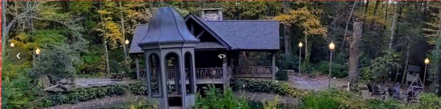
NEW OUTDOOR LIGHTING at the Pavilion.